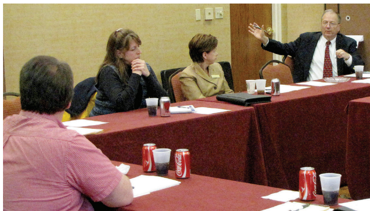
Community leaders met throughout 2010 to finalize the County's Economic Development Strategy Update.

The new strategy will concentrate the focus of future economic development activities on a few targeted areas. This should allow key initiatives to happen faster. The finished strategy is scheduled for release in 2011.